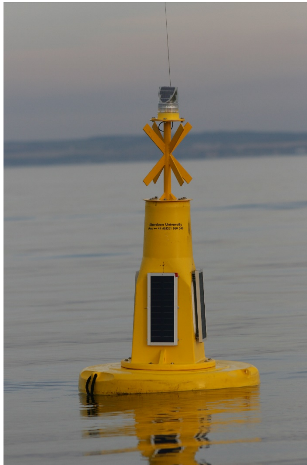
Hydrophone buoy, as deployed.