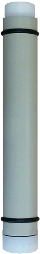
Acoustic logger (600 x 95mm)